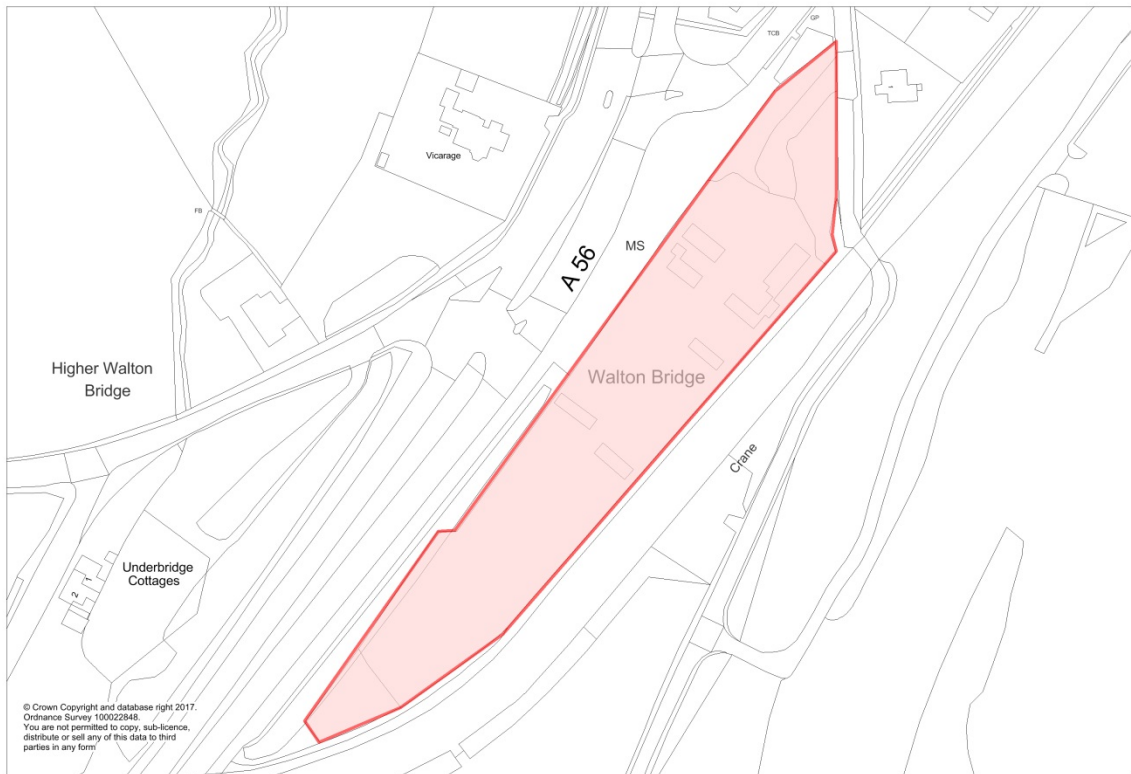
Figure 1: Site Boundary R18/252