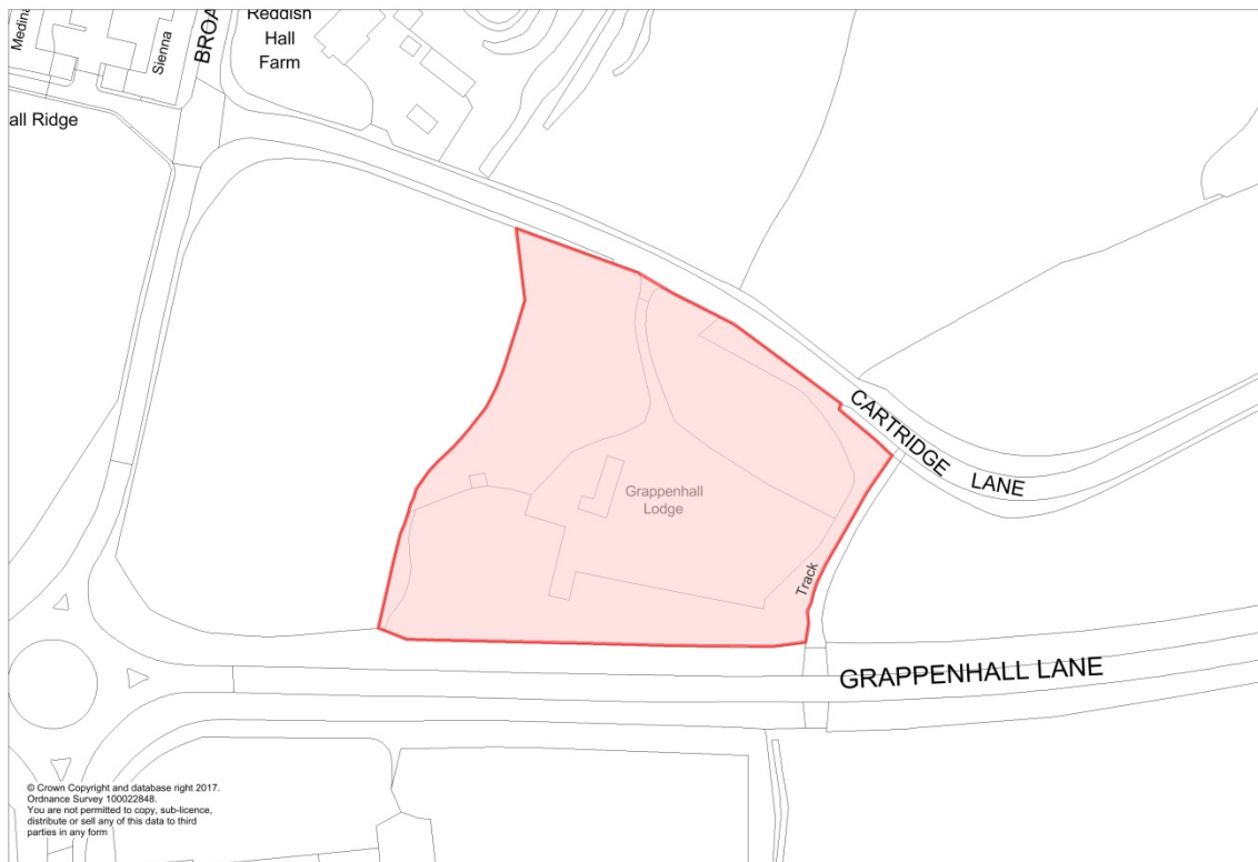
Figure 1: Site Boundary R18/253