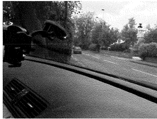
LOOKING LEFT BEFORE EXITING NO. 54.

CAR BONNET HAS TO BE RAISED ACROSS PAVEMENT TO EVEN SEE THIS FAR -