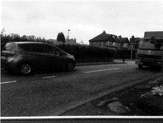
LOOKING LIGHT FROM MY CAR WINDOW BEFORE TRYING TO GO OUT NO. 54 HILMORLAND