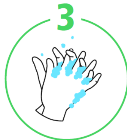
In between the fingers