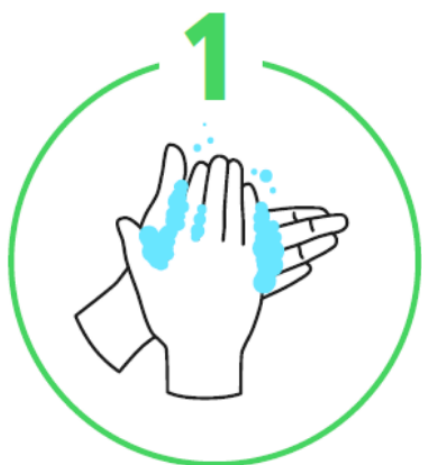
Palm to palm