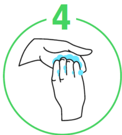
The back of the fingers