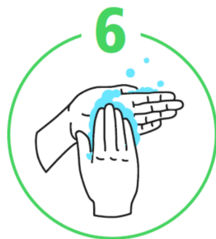
The tips of the fingers