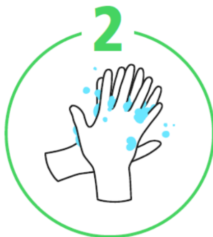
The backs of hands