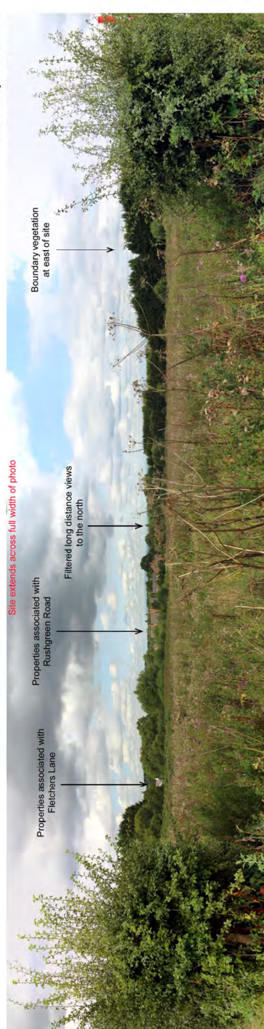
Photoviewpoint 3: View from south of the site facing north with glimpsec long distance views.