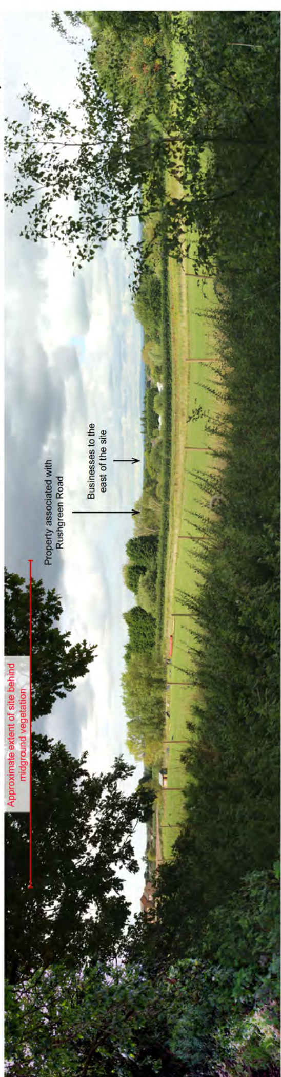
Photoviewpoint 5: View from bridleway (Lymm BR31) between Pepper Street and Outrightington Lane approximately 170m from site