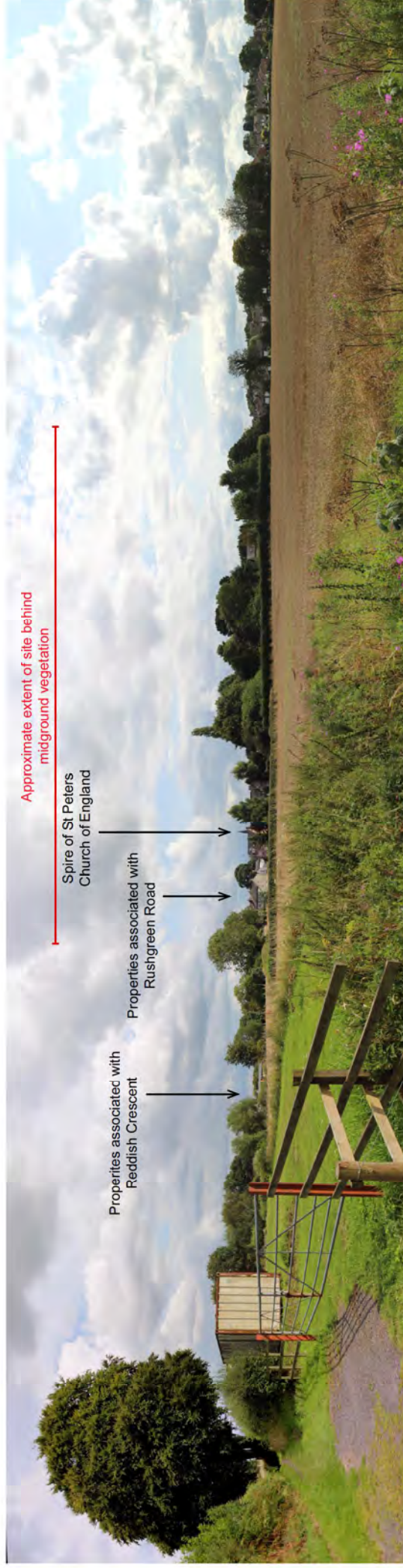
Photoviewpoint 6: View from Bridleway (BR46) between Reddish Lane and Reddish Crescent facing south east approximately 300m from site.