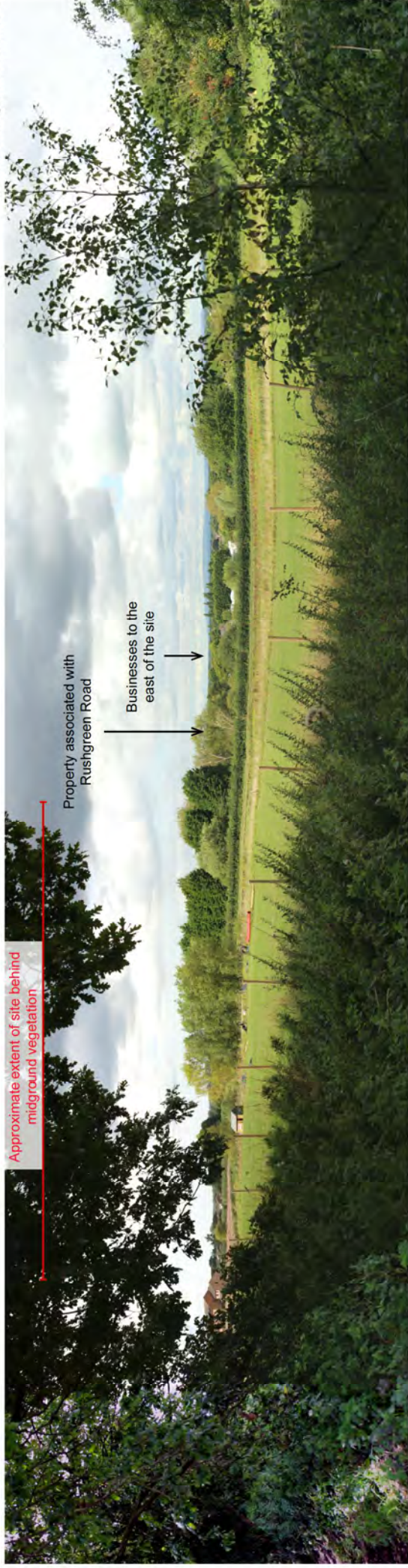
Photoviewpoint 5: View from brideway (Lymm BR31) between Pepper Street and Outrighting Lane approximately 170m from site