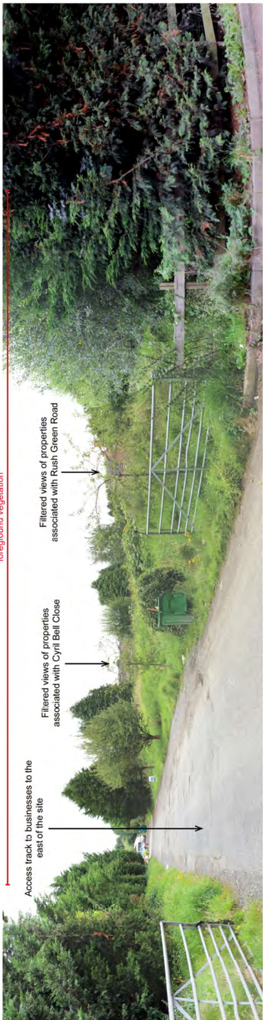
Photoviewpoint 1: View from north of the site at junction between unnamed access track to businesses and Rush Green Road.

Approximate extent of site behind foreground vegetation