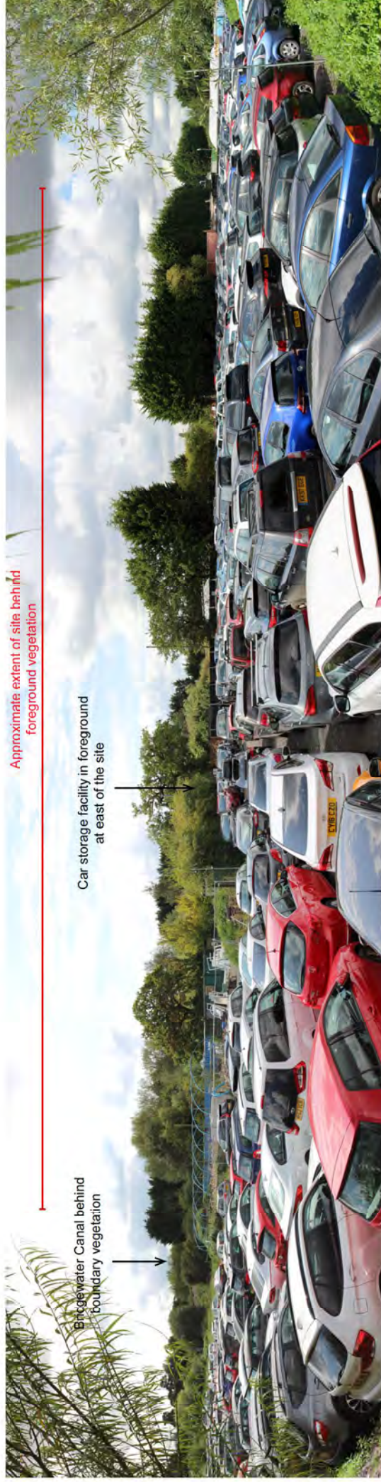
Photoviewpoint 4: View across car storage and boundary vegetation to the east of the site approximately 150m from site.