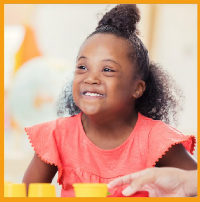
Making Warrington a SEND Confident Town